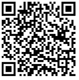
Catholic Welfare Services

<u>DONATIONS</u> FOR THE UNDERPRIVILEGED - Please continue to support the Catholic Welfare Services financially as we minister to the poor and needy in our midst irrespective of race or creed. Parishioners may donate to C.W.S. via S Pay Global by scanning this QR code. Verify that the recipient is 'Catholic Welfare Services' before confirming the transaction. Parishioners may also do online transfer or cash deposit to the following: